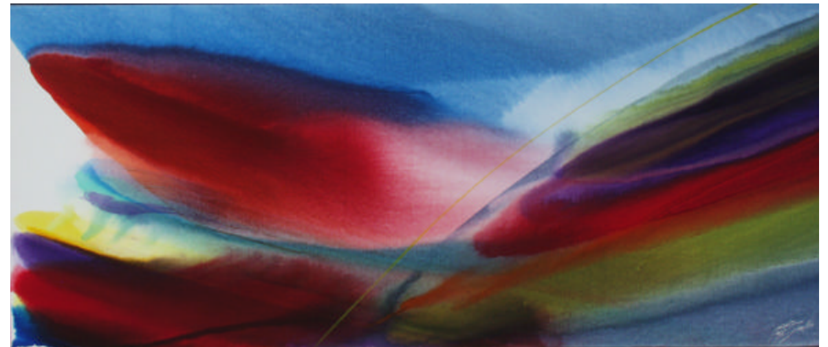
Phenomena Big Sur Spectrum by Paul Jenkins